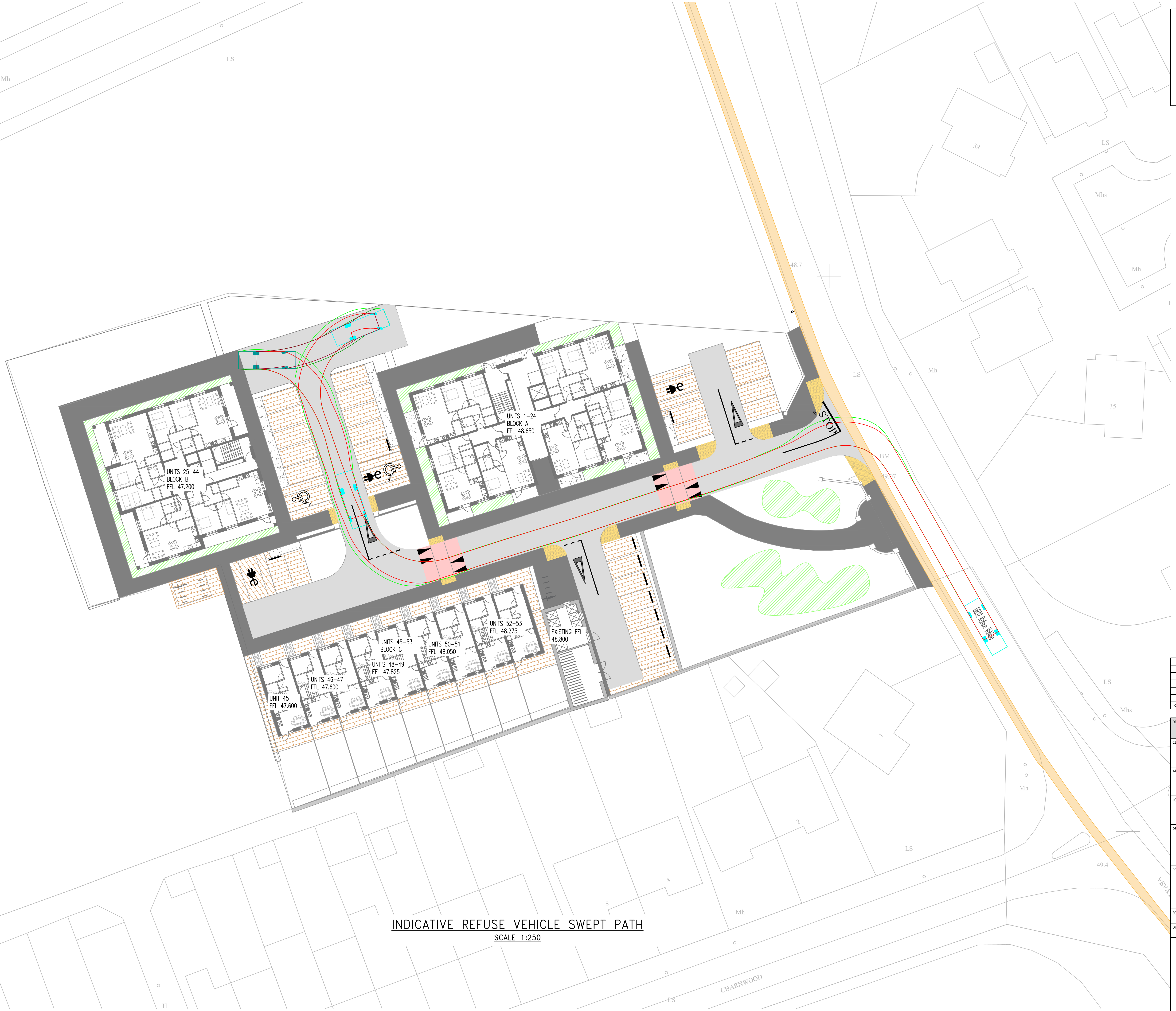
INDICATIVE REFUSE VEHICLE SWEEP PATH SCALE 1:250